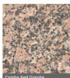
Combo Red Granite