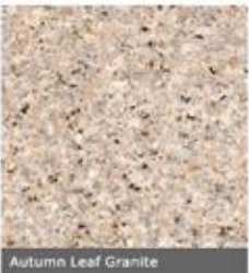
Autumn Leaf Granite