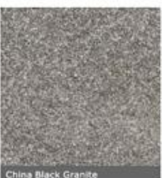
China Black Granite